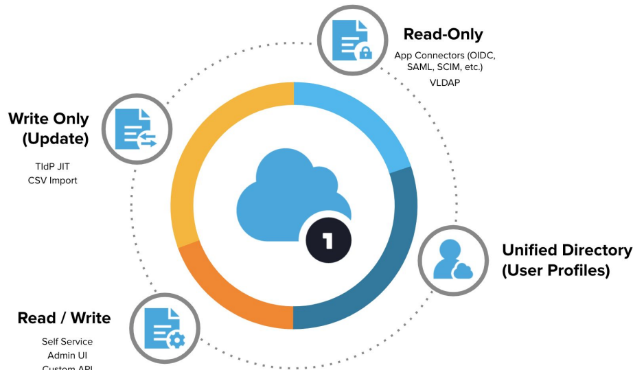
Figure 2: OneLogin offers several options for transferring profile data so you can work with the most-up-to-date customer information. Leverage our pre-built application connectors using SAML, OpenID Connect, etc. Alternatively, use VLDAP to virtualize your on-prem LDAP directory. TIDP with JIT or CSV upload enhances and updates profile information, while the OneLogin self-service portal and administration UI brings read and write capabilities.